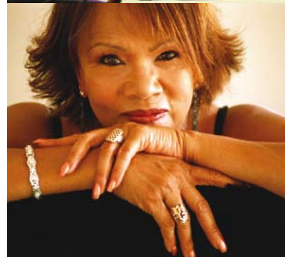
LEFT PAGE - DIONNE WARWICK; RIGHT PAGE - TOP: IRMA THOMAS; MIDDLE: BETTYE LAVETTE; BOTTOM: CANDI STATON